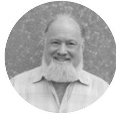
DAVID CHAUM CEO, Elixir