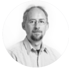
DR. ADAM BACK CEO, Blockstream