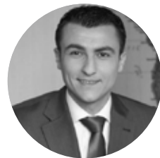
HON. SILVIO SCHEMBRI Jr Minister for Financial Services, Digital Economy & Innovation, Government of Malta