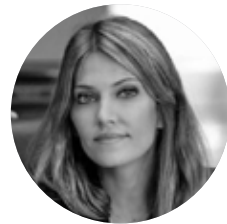
EVA KAILI Member of European Parliament, Chair of STOA, European Parliament