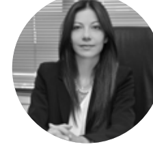
DEMETRA KALOGEROU Chairwoman, Cyprus Securities & Exchange Commission