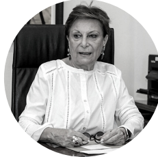
Stephie Dracou Minister of Justice Minister and Public Order